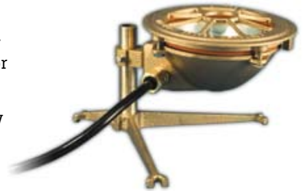
100-250 Watts, 120 Volts

Optional: Colored acrylic lens covers - red, blue, green, and amber available.