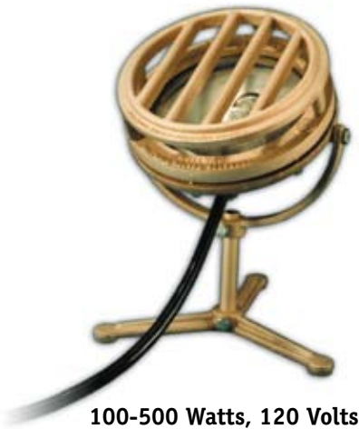
100-500 Watts, 120 Volts 100 Watts, 12 Volts

Optional: Colored lenses - red, blue, green, amber, and turquoise available.